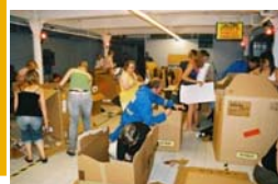
Image: Congestion, the first Live Art Woc event

Project Overview: To develop a pilot programme of 4, 'for-one-night-only', live art events in the new gallery space at Cow Lane Studio, Salford. Profiling the work of 4 Salford-based artists: A showcase for new work creating an opportunity for artistic debate and discussion of work in this field. The next Live Art WOC will happen in Jan 07.