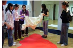
Identity Project: Wai Yin Chinese Women's Society Youth Group

The preview evening is on 6 October, 6.00pm.