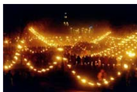
Compagnie Carabosse

Carabosse make glorious atmospheric structures laced with firepots - a kind of fantasy never-neverland. Enjoy!