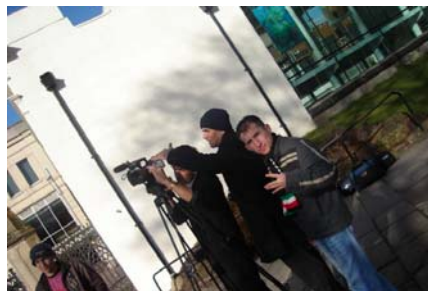
Kurdish Creative Film Makers on location

If you are interested in taking part please contact Alan Amin, 07916 288 095 , kcfcfilm@yahoo.co.uk , www.kurdishcreativefilm.com