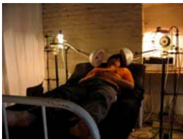
Staalplaat Soundsystem: The Ultrasound of Therapy