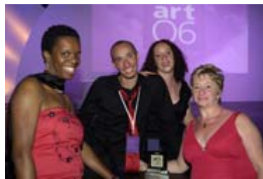
Company Fierce accepting their trophy

for the work we do with young people and within the community. We feel this is testament to all our hard work and will use this as a driving force to continue with the work we are doing."