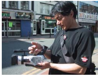
Jesus filming in the city centre

Exodus Shorts is set to continue next year, if there are any film-makers that would like to get involved, please contact amy@can.uk.com