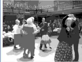
Dancers at Victoria Baths