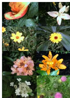
"daisy bank flowers" from the ALL egg project. By Phil