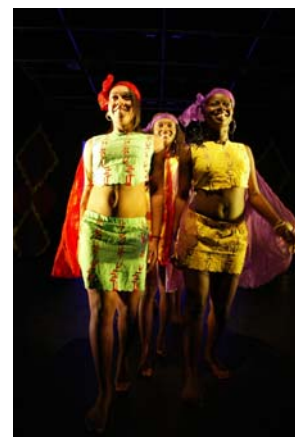
Afrocats